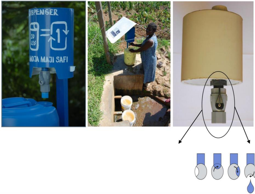
Figure 1: The Chlorine Dispenser